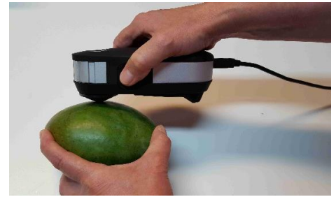
HortiCol spot measurement

Spectral range: 380 – 730nm Optical resolution: 10nm Illumination spot size: 3.5mm Light source: gas filled tungsten